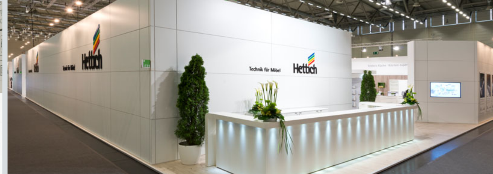
Come and experience the heart of Germany