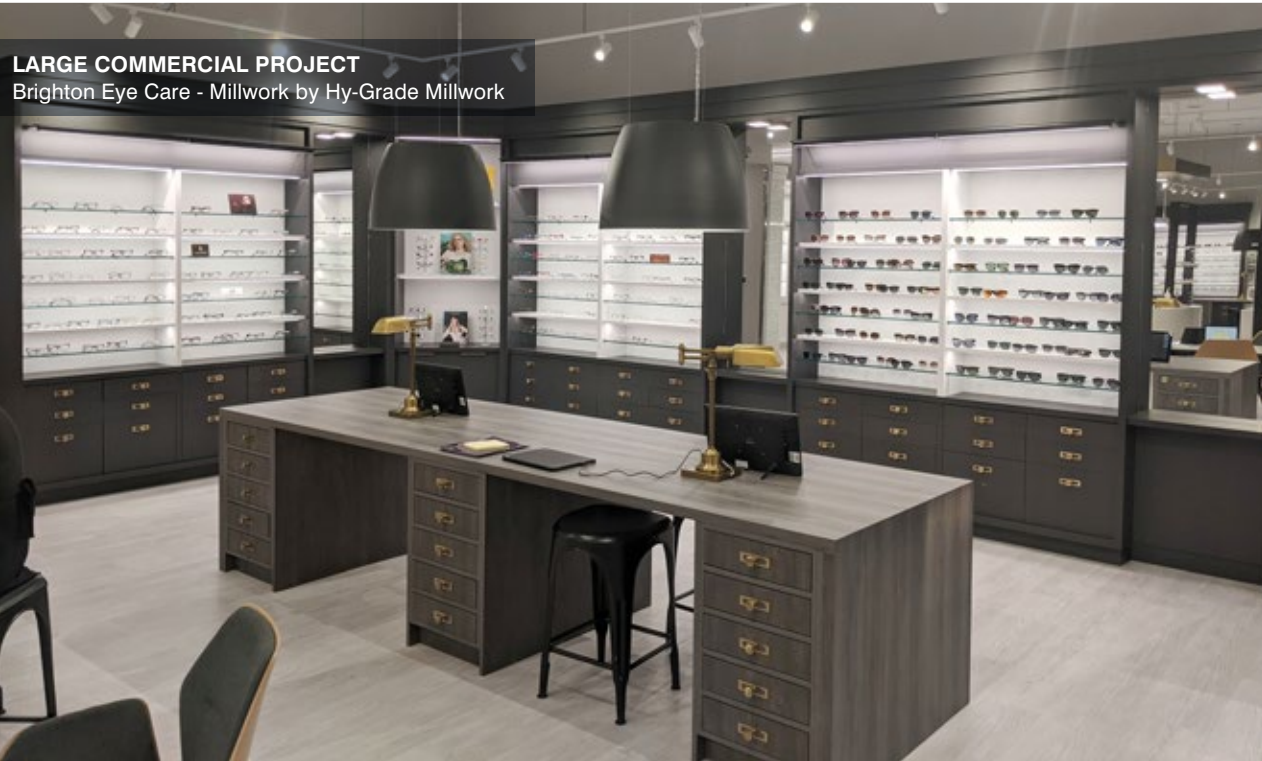
LARGE COMMERCIAL PROJECT Brighton Eye Care - Millwork by Hy-Grade Millwork