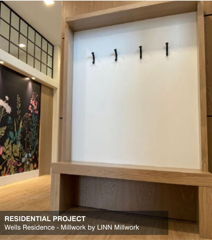
RESIDENTIAL PROJECT Wells Residence - Millwork by LINN Millwork