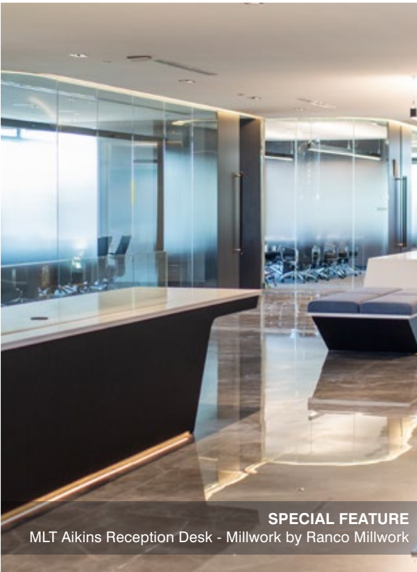
SPECIAL FEATURE MLT Aikins Reception Desk - Millwork by Ranco Millwork