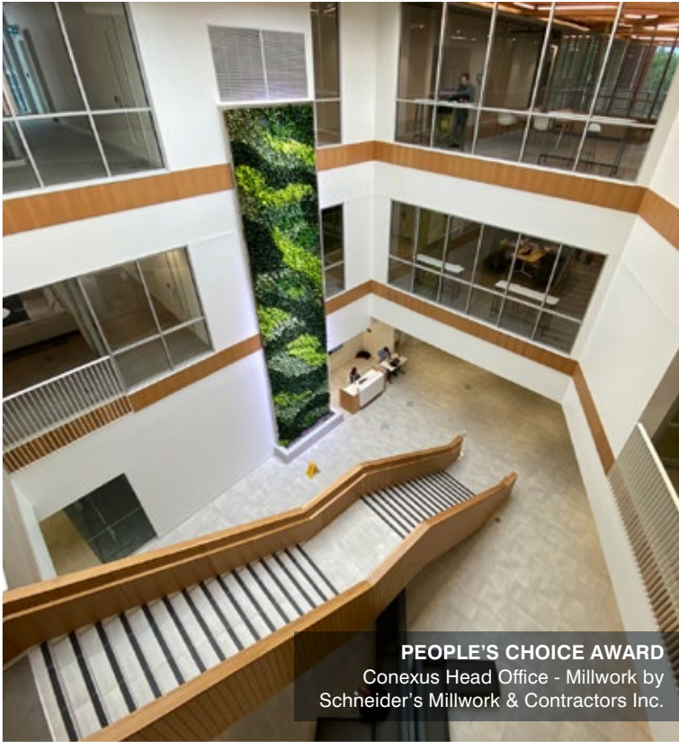
PEOPLE'S CHOICE AWARD Conexus Head Office - Millwork by Schneider's Millwork & Contractors Inc.